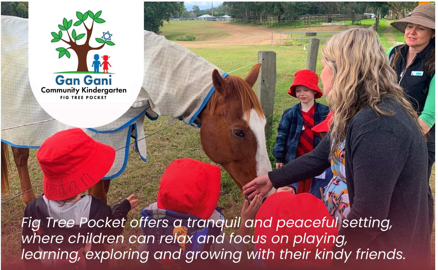
Fig Tree Pocket offers a tranquil and peaceful setting, where children can relax and focus on playing, learning, exploring and growing with their kindy friends.