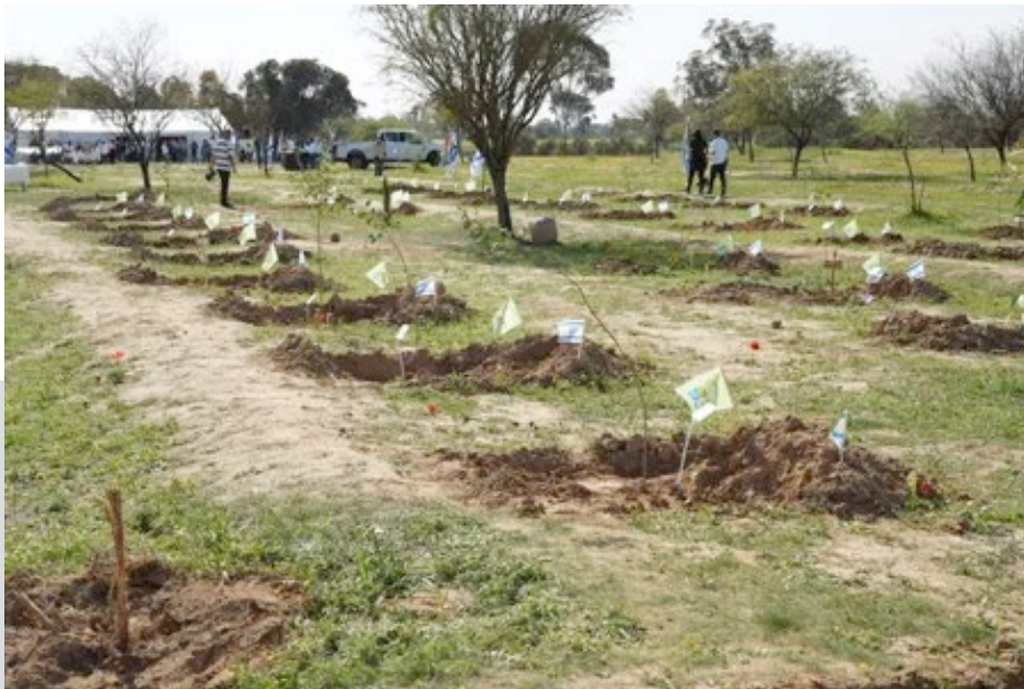
The area prepared for the tree planting